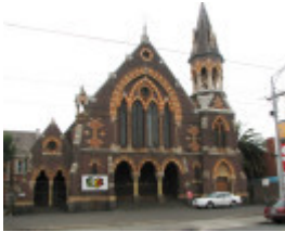
FORMER WESLEYAN CHURCH AND MODEL SUNDAY SCHOOL SOHE 2008