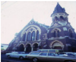
1 former wesleyan church & model school sydney road brunswick front view