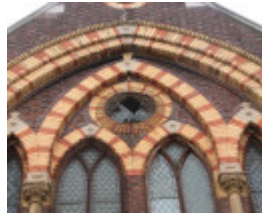
FORMER WESLEYAN CHURCH AND MODEL SUNDAY SCHOOL SOHE 2008