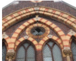
FORMER WESLEYAN CHURCH AND MODEL SUNDAY SCHOOL SOHE 2008