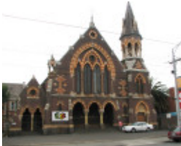
FORMER WESLEYAN CHURCH AND MODEL SUNDAY SCHOOL SOHE 2008