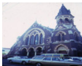
1 former wesleyan church & model school sydney road brunswick front view