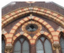
FORMER WESLEYAN CHURCH AND MODEL SUNDAY SCHOOL SOHE 2008