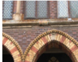
FORMER WESLEYAN CHURCH AND MODEL SUNDAY SCHOOL SOHE 2008