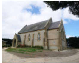
HOLY TRINITY ANGLICAN CHURCH AND VICARAGE SOHE 2008