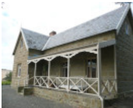
HOLY TRINITY ANGLICAN CHURCH AND VICARAGE SOHE 2008