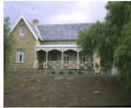
1 holy trinity anglican church merrawarp road ceres vicarage front view