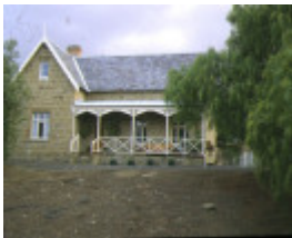
1 holy trinity anglican church merrawarp road ceres vicarage front view