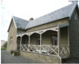
HOLY TRINITY ANGLICAN CHURCH AND VICARAGE SOHE 2008