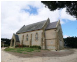
HOLY TRINITY ANGLICAN CHURCH AND VICARAGE SOHE 2008