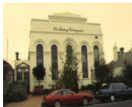
1 congregational church mckillop street geelong front view jun1995