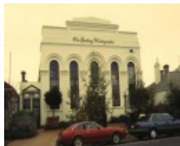
1 congregational church mckillop street geelong front view jun1995