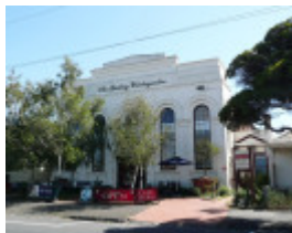
WINTERGARDEN SOHE 2008