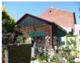
WINTERGARDEN SOHE 2008