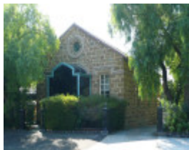
FORMER GAELIC CHURCH AND SCHOOLHOUSE SOHE 2008