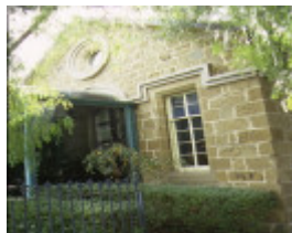
1 former gaelic church & schoolhouse geelong front entrance apr1997