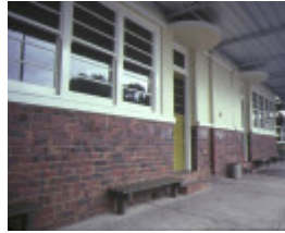
primary school number 1924 drouin class room entrance mar1985