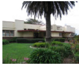
H1627 Drouin Primary School Everett building front elevation from west 2007