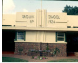
Primary School Number 1924 Drouin Front