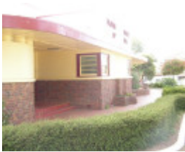
h01627 primary school no 1924 princes hwy drouin front