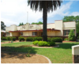
PRIMARY SCHOOL NO. 1924 SOHE 2008