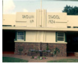
Primary School Number 1924 Drouin Front