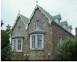
1 coriyule homestead drysdale side view of homestead