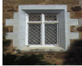
coriyule homestead mcdermott road drysdale detail of stone framed window