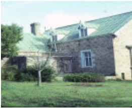
coriyule homestead mcdermott road drysdale view of top floor