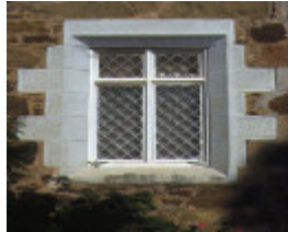
coriyule homestead mcdermott road drysdale detail of stone framed window