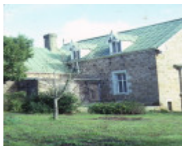
coriyule homestead mcdermott road drysdale view of top floor