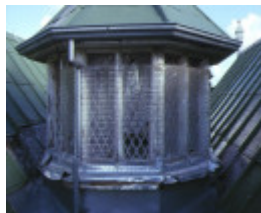
coriyule homestead mcdermott road drysdale enclosed glass room on roof