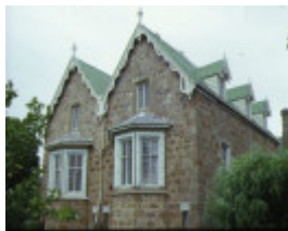
1 coriyule homestead drysdale side view of homestead