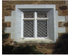
coriyule homestead mcdermott road drysdale detail of stone framed window