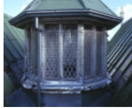
coriyule homestead mcdermott road drysdale enclosed glass room on roof