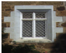
coriyule homestead mcdermott road drysdale detail of stone framed window