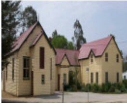
H0550 Briagolong Mechanics Institute