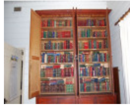
H0550 Briag library