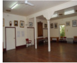
H0550 supper room briagolongMI