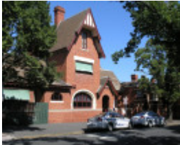
POLICE STATION AND LOCK-UP SOHE 2008