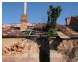
H0863 FORMER BENDIGO HOTEL LHA 2015 5.JPG