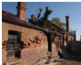
H0863 FORMER BENDIGO HOTEL LHA 2015 3.JPG