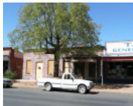
FORMER BENDIGO HOTEL SOHE 2008