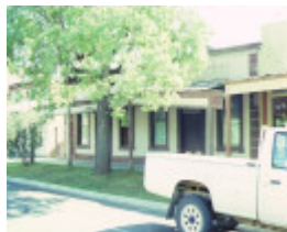
1 former bendigo hotel dunolly front view