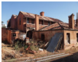
H0863 FORMER BENDIGO HOTEL LHA 2015 1.JPG