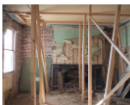
H0863 FORMER BENDIGO HOTEL LHA 2015 7.JPG