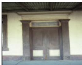
former bendigo hotel dunolly front entrance