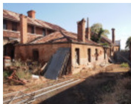
H0863 FORMER BENDIGO HOTEL LHA 2015 2.JPG