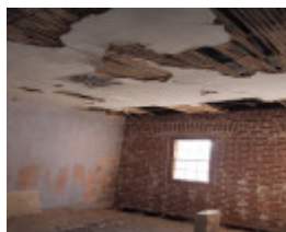
H0863 FORMER BENDIGO HOTEL LHA 2015 6.JPG