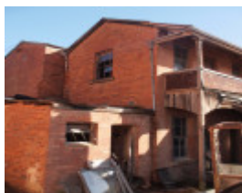
H0863 FORMER BENDIGO HOTEL LHA 2015 4.JPG