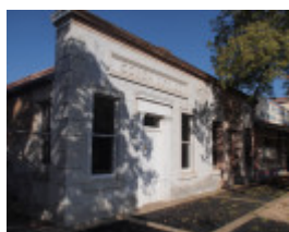
H0863 FORMER BENDIGO HOTEL LHA 2015 8.JPG