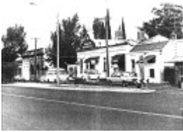
Buildings on Eaglehawk Road, California Gully