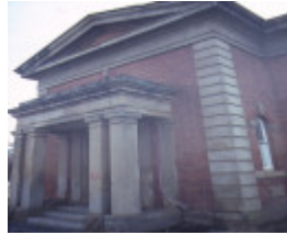
dunolly court house entrance detail aug1984