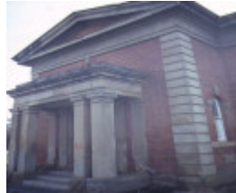
dunolly court house entrance detail aug1984