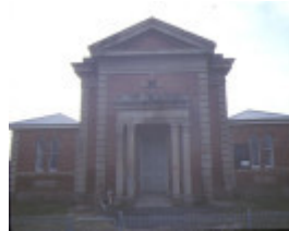
1 dunolly court house front elevation aug1984