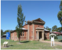
DUNOLLY COURT HOUSE SOHE 2008