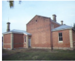
dunolly court house side elevation aug1984