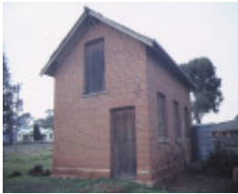
dunolly court house out building aug1984