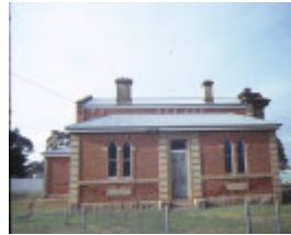
dunolly court house rear elevation aug1984