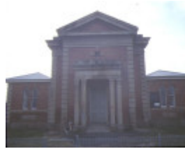
1 dunolly court house front elevation aug1984