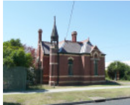
ST ALBANS HOMESTEAD GATE LODGE SOHE 2008