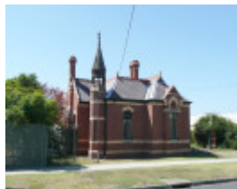
ST ALBANS HOMESTEAD GATE LODGE SOHE 2008