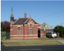
ST ALBANS HOMESTEAD GATE LODGE SOHE 2008