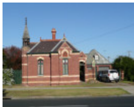
ST ALBANS HOMESTEAD GATE LODGE SOHE 2008