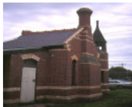
1 st albans homestead gate lodge whittington side view may1995