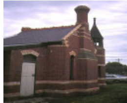
1 st albans homestead gate lodge whittington side view may1995