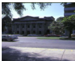
1 former baptist church house ext front