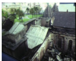
former baptist church house ext roof