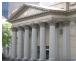
FORMER BAPTIST CHURCH HOUSE SOHE 2008