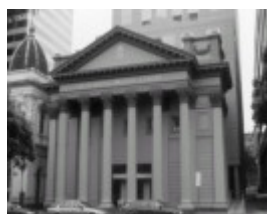
former baptist church house front elevation