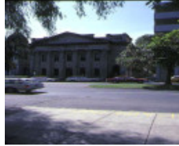
1 former baptist church house ext front