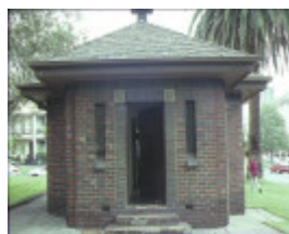
h00945 old men's shelter albert street east melbourne front view