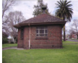
old men's shelter albert street east melbourne rear view