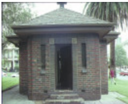
h00945 old men's shelter albert street east melbourne front view