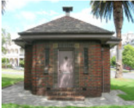
OLD MEN'S SHELTER SOHE 2008