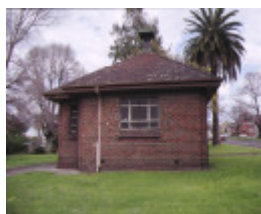
old men's shelter albert street east melbourne rear view