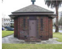
h00945 1 old men's shelter powlett reserve cnr powlett and albert east melbourne front view