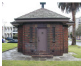
h00945 1 old men's shelter powlett reserve cnr powlett and albert east melbourne front view