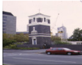
st patricks cathedral east melb college tower