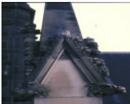
st patricks cathedral east melb external detail