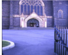
st patricks cathedral east melb external entrance