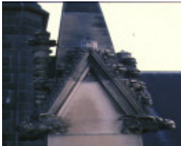
st patricks cathedral east melb external detail