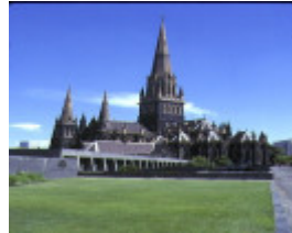
1 st patricks cathedral east melb external view