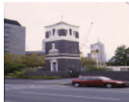
st patricks cathedral east melb college tower