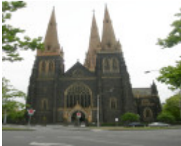
ST PATRICKS CATHEDRAL PRECINCT SOHE 2008