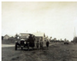
Ballarat Road, Meredith, c.1925.