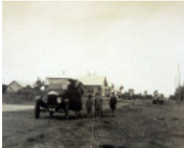
Ballarat Road, Meredith, c.1925.