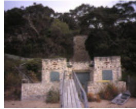
1 ilyuka lime kiln bathing box point king road portsea front view