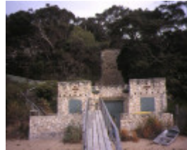
1 ilyuka lime kiln bathing box point king road portsea front view