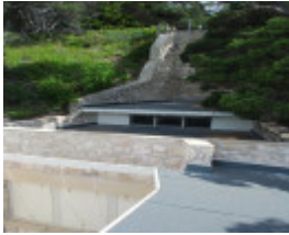
ILYUKA LIME KILN/BATHING BOX SOHE 2008