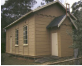
1 fryerstown methodist church hall heron street fryerstown entrance 1997