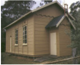
1 fryerstown methodist church hall heron street fryerstown entrance 1997