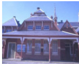
h01622 primary school no 4 barnett st avoca front of school