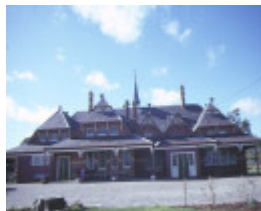
1 primary school number 4 barnett street avoca front elevation