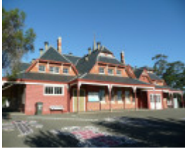
PRIMARY SCHOOL NO. 4 SOHE 2008