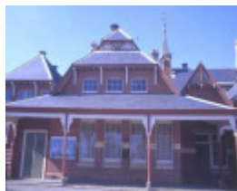
h01622 primary school no 4 barnett st avoca front of school