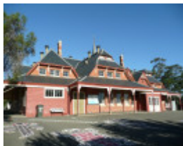
PRIMARY SCHOOL NO. 4 SOHE 2008