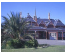
h01622 primary school no 4 barnett st avoca west view