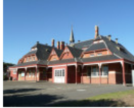
PRIMARY SCHOOL NO. 4 SOHE 2008