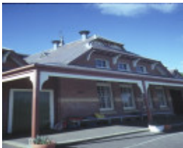
primary school number 4 barnett street avoca front detail