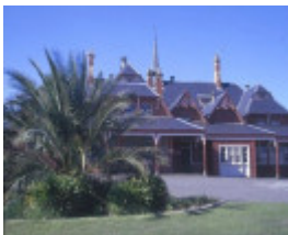
h01622 primary school no 4 barnett st avoca west view