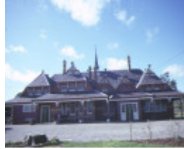
1 primary school number 4 barnett street avoca front elevation