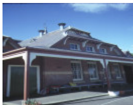
primary school number 4 barnett street avoca front detail