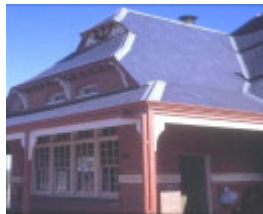
h01622 primary school no 4 barnett st avoca classroom