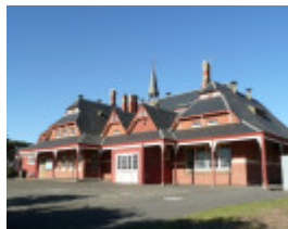
PRIMARY SCHOOL NO. 4 SOHE 2008