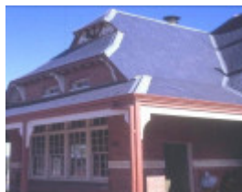
h01622 primary school no 4 barnett st avoca classroom