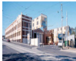
Former Hawthorn Tramway Depot During Redevelopment