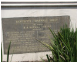
FORMER HAWTHORN TRAMWAYS TRUST DEPOT SOHE 2008