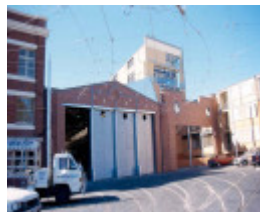
Former Hawthorn Tramway Depot During Redevelopment