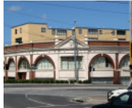
FORMER HAWTHORN TRAMWAYS TRUST DEPOT SOHE 2008