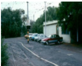
Former Hawthorn Tramway Depot Fan and Tower Wagon Shed