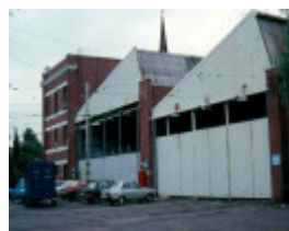
Former Hawthorn Tramway Depot from South West