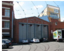
FORMER HAWTHORN TRAMWAYS TRUST DEPOT SOHE 2008