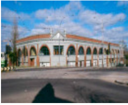
Former Hawthorn Tramway Depot 1990s