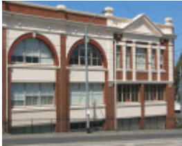
FORMER HAWTHORN TRAMWAYS TRUST DEPOT SOHE 2008