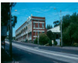
Former Hawthorn Tramway Depot from North West