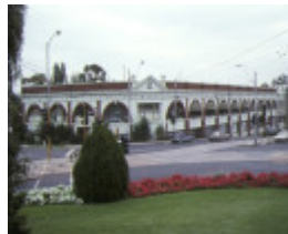
1 former hawthorn tramways trust depot front corner view