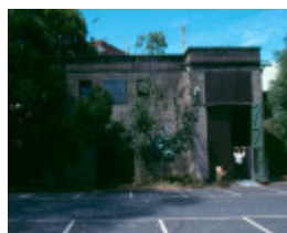
Former Hawthorn Tramway Depot Tower Wagon Shed