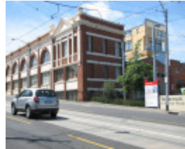
FORMER HAWTHORN TRAMWAYS TRUST DEPOT SOHE 2008