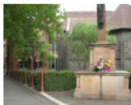
ST PETERS EASTERN HILL PRECINCT SOHE 2008