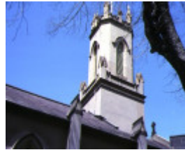
st peters church and vicarage exterior tower