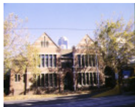
st peters church and vicarage exterior hall