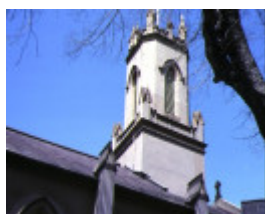
st peters church and vicarage exterior tower