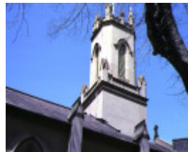
st peters church and vicarage exterior tower