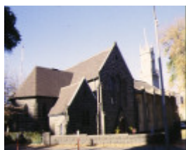
1 st peters church and vicarage exterior view