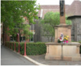
ST PETERS EASTERN HILL PRECINCT SOHE 2008