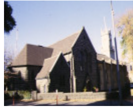
1 st peters church and vicarage exterior view