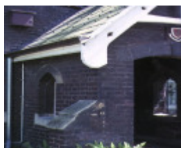
st peters church and vicarage exterior entrance