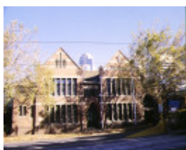
st peters church and vicarage exterior hall