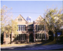
st peters church and vicarage exterior hall