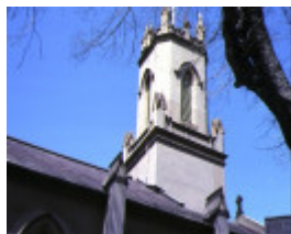
st peters church and vicarage exterior tower