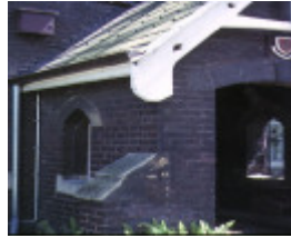
st peters church and vicarage exterior entrance