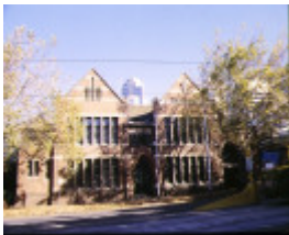
st peters church and vicarage exterior hall