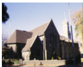
1 st peters church and vicarage exterior view