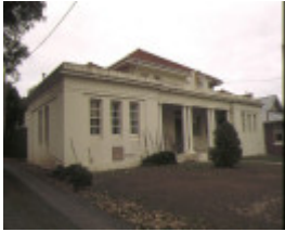
1 wonthaggi court house front view may1993