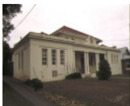
1 wonthaggi court house front view may1993