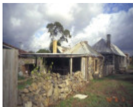
h00979 ziebells farm gardenia st thomastown drying shed she project 2003