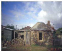
h00979 ziebells farm gardenia st thomastown smokehouse laundry outbuilding she project 2003