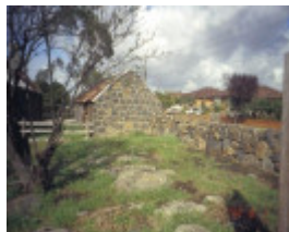
h00979 ziebells farm gardenia st thomastown barn outbuilding north end she project 2003