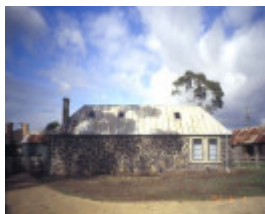
h00979 ziebells farm gardenia st thomastown view of farmhouse she project 2003