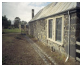
h00979 ziebells farm gardenia st thomastown farmhouse north wall stone gutter she project 2003