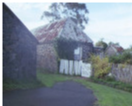
1 ziebell's farmhouse gardenia road thomastown front view