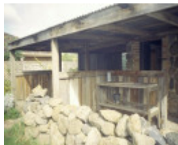
h00979 ziebells farm gardenia st thomastown drying shed east end she project 2003