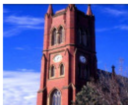
h01372 st pauls anglican cathedral myers st bendigo exterior she project 2003