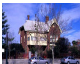
h01372 st pauls anglican cathedral myers st bendigo rectory she project 2003