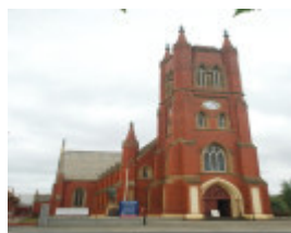
ST PAULS ANGLICAN CATHEDRAL SOHE 2008