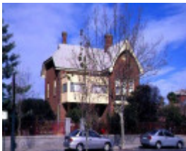
h01372 st pauls anglican cathedral myers st bendigo rectory she project 2003