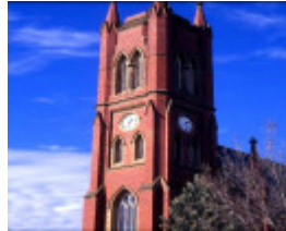
h01372 st pauls anglican cathedral myers st bendigo exterior she project 2003