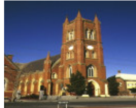
1 st pauls cathedral bendigo front view jul1997