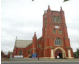
ST PAULS ANGLICAN CATHEDRAL SOHE 2008