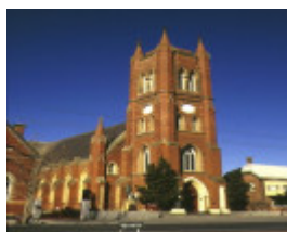
1 st pauls cathedral bendigo front view jul1997