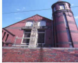
st john's church victoria parade east melbourne detail of runic cross