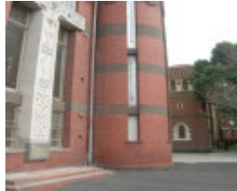
ST JOHNS CHURCH SOHE 2008