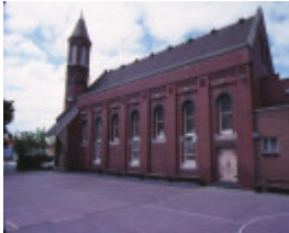
1 st john's church victoria parade east melbourne side view nov1988