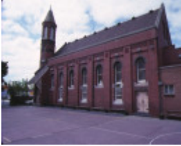
1 st john's church victoria parade east melbourne side view nov1988