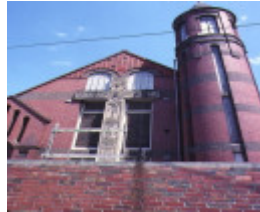
st john's church victoria parade east melbourne detail of runic cross