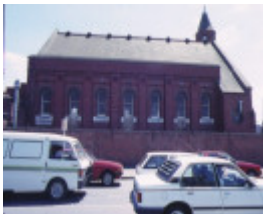
st john's church victoria parade east melbourne hoddle street side view nov1988