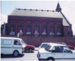
st john's church victoria parade east melbourne hoddle street side view nov1988