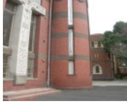
ST JOHNS CHURCH SOHE 2008