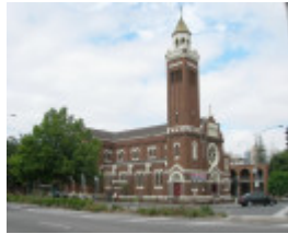
ST JOHNS CHURCH SOHE 2008