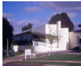
former hamilton tuberculosis chalet tyers street hamilton view from street she project 2003