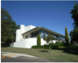
FORMER HAMILTON TUBERCULOSIS CHALET SOHE 2008