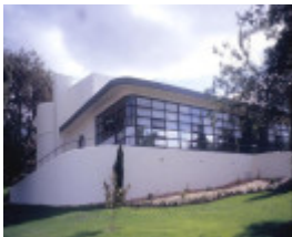
former hamilton tuberculosis chalet tyers street hamilton view from carpark entrance she project 2003