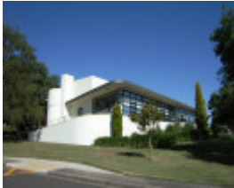
FORMER HAMILTON TUBERCULOSIS CHALET SOHE 2008