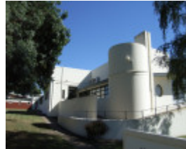
FORMER HAMILTON TUBERCULOSIS CHALET SOHE 2008