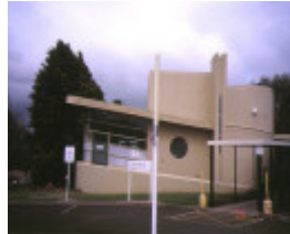
1 former hamilton tuberculosis chalet tyers-street hamilton side elevation aug1994