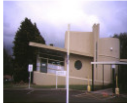
1 former hamilton tuberculosis chalet tyers-street hamilton side elevation aug1994