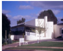
former hamilton tuberculosis chalet tyers street hamilton view from street she project 2003