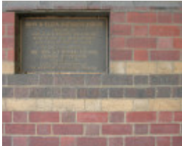
RETAINING WALL SOHE 2008