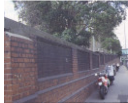
1 flinders street extension retaining wall street view mar1999