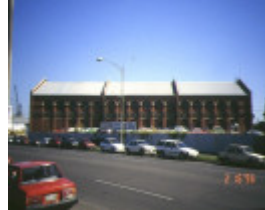
1 queens warehouse blyth street west melbourne side view feb1996