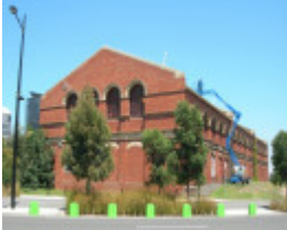
QUEENS WAREHOUSE SOHE 2008