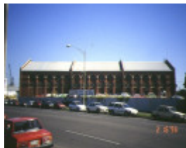
1 queens warehouse blyth street west melbourne side view feb1996