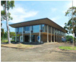
FORMER BP REFINERY ADMINISTRATION BUILDING SOHE 2008