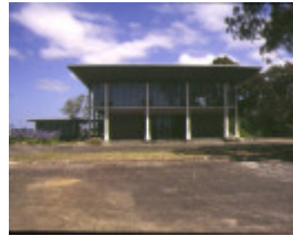
1 former bp refinery administration building the esplanade crib point front view jan1994