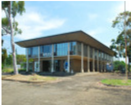
FORMER BP REFINERY ADMINISTRATION BUILDING SOHE 2008