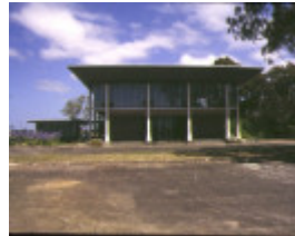
1 former bp refinery administration building the esplanade crib point front view jan1994