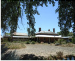
FORMER POLICE SUPERINTENDENT'S RESIDENCE SOHE 2008