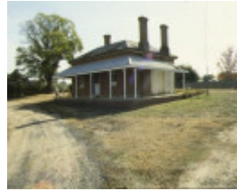
h00986 old1 former police superintendent s residence lislie street stawell front view may1993