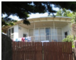
ROUND HOUSE SOHE 2008