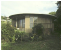
1 round house frankston front view jan1993