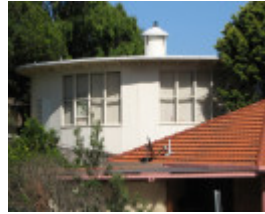
ROUND HOUSE SOHE 2008