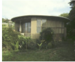
1 round house frankston front view jan1993