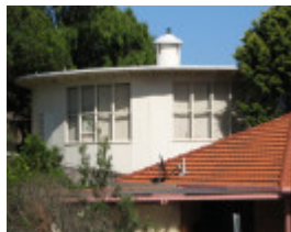
ROUND HOUSE SOHE 2008