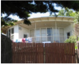
ROUND HOUSE SOHE 2008