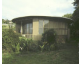
1 round house frankston front view jan1993