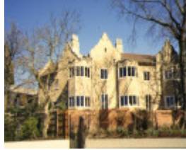
Wyalla Monaro Road Kooyong Exterior View August 1994