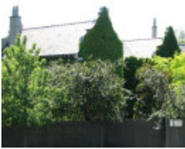
THANES SOHE 2008