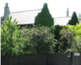
THANES SOHE 2008