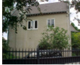
Wyalla Monaro Road Kooyong West Wing November 2001