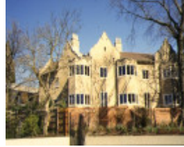
Wyalla Monaro Road Kooyong Exterior View August 1994