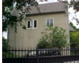
Wyalla Monaro Road Kooyong West Wing November 2001