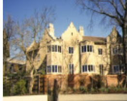
Wyalla Monaro Road Kooyong Exterior View August 1994