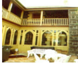
h61 157 hotham street rear courtyard june2000