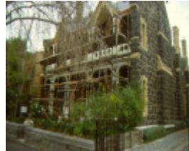
157 hotham street verandah restoration