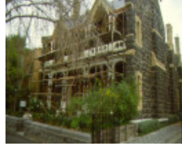
157 hotham street verandah restoration