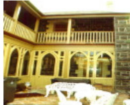
h61 157 hotham street rear courtyard june2000