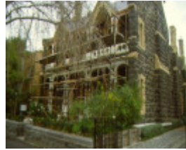
157 hotham street verandah restoration