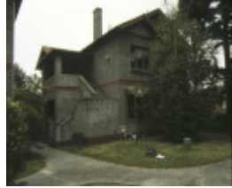
1 building 6/1 former ardoch educational centre dandenong road st kilda front view mar1993