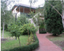
FORMER ARDOCH EDUCATIONAL CENTRE SOHE 2008