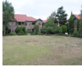
FORMER ARDOCH EDUCATIONAL CENTRE SOHE 2008