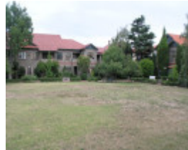
FORMER ARDOCH EDUCATIONAL CENTRE SOHE 2008