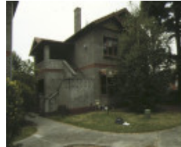
1 building 6/1 former ardoch educational centre dandenong road st kilda front view mar1993