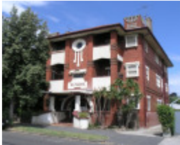
BILTMORE SOHE 2008