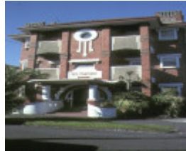
Patterson Biltmore Flat St Kilda