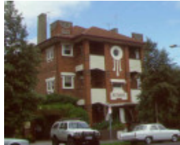
1 biltmore 36 eildon rd st kilda ac2 apr1999