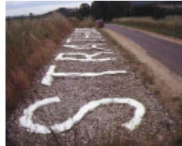
1 strathbogie air navaid strathbogie view from front end