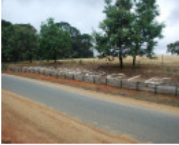
STRATHBOGIE AERIAL NAVAID SOHE 2008