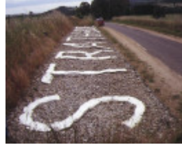
1 strathbogie air navaid strathbogie view from front end