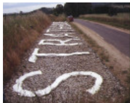
1 strathbogies air navaid strathbogies view from front end