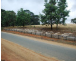
STRATHBOGIES AERIAL NAVAID SOHE 2008