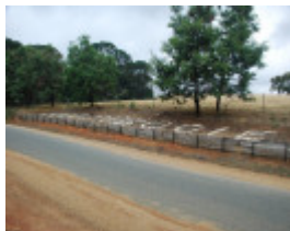
STRATHBOGIE AERIAL NAVAID SOHE 2008