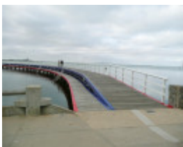
EASTERN BEACH BATHING COMPLEX AND RESERVE SOHE 2008