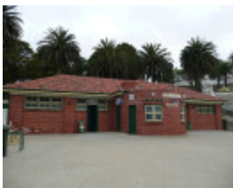
EASTERN BEACH BATHING COMPLEX AND RESERVE SOHE 2008