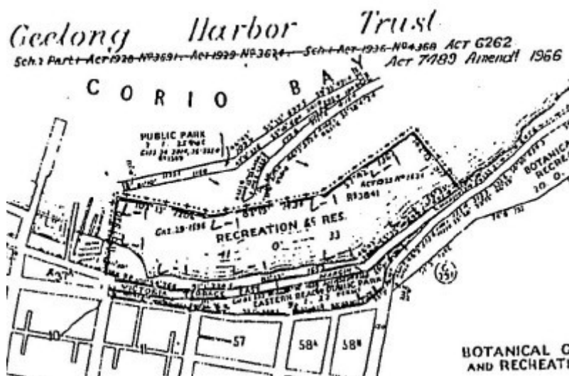
H0929 eastern beach extent