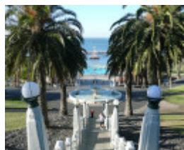
EASTERN BEACH BATHING COMPLEX AND RESERVE SOHE 2008