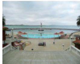
EASTERN BEACH BATHING COMPLEX AND RESERVE SOHE 2008