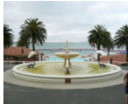
EASTERN BEACH BATHING COMPLEX AND RESERVE SOHE 2008