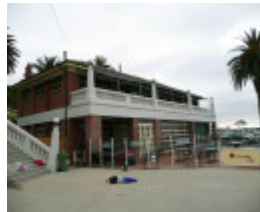
EASTERN BEACH BATHING COMPLEX AND RESERVE SOHE 2008