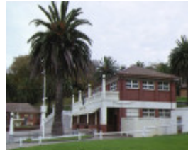
1 eastern beach bathing complex & reserve geelong cafe side view