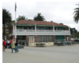
EASTERN BEACH BATHING COMPLEX AND RESERVE SOHE 2008