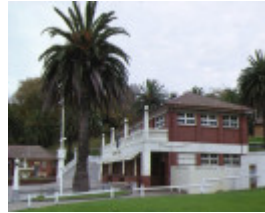
1 eastern beach bathing complex & reserve geelong cafe side view