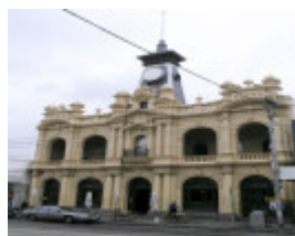
FORMER COLLINGWOOD POST OFFICE SOHE 2008