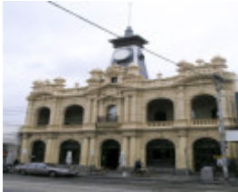
FORMER COLLINGWOOD POST OFFICE SOHE 2008