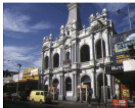
1 former collingwood post office smith street collingwood front elevation mar1993