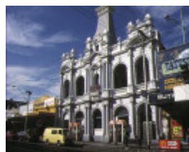
1 former collingwood post office smith street collingwood front elevation mar1993