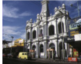
1 former collingwood post office smith street collingwood front elevation mar1993