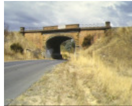
1 chewton railway precinct fryerston road chewton arched bridge 1 apr1998