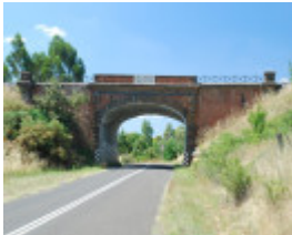
CHEWTON RAILWAY PRECINCT (MURRAY VALLEY RAILWAY, MELBOURNE TO ECHUCA) SOHE 2008