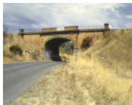
CHEWTON RAILWAY PRECINCT (MURRAY VALLEY RAILWAY, MELBOURNE TO ECHUCA) SOHE 2008