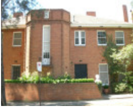
VICE CHANCELLOR'S HOUSE SOHE 2008