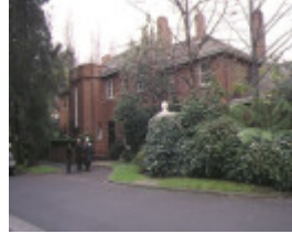
1 vice chancellors house university of melbourne parkville front view