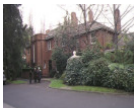
1 vice chancellors house university of melbourne parkville front view