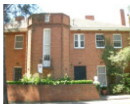
VICE CHANCELLOR'S HOUSE SOHE 2008