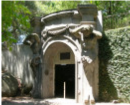
UNDERGROUND CAR PARK SOHE 2008