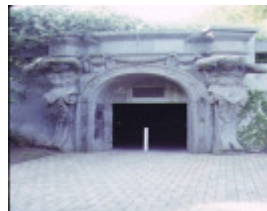
UNDERGROUND CAR PARK SOHE 2008

1 underground car park university of melbourne parkville walking entrance former colonial bank entrance may1989