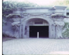
1 underground car park university of melbourne parkville walking entrance former colonial bank entrance may1989