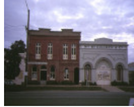
1 former permewan wright offices echuca front view