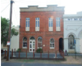
FORMER PERMEWAN WRIGHT OFFICES SOHE 2008