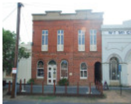
FORMER PERMEWAN WRIGHT OFFICES SOHE 2008