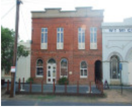
FORMER PERMEWAN WRIGHT OFFICES SOHE 2008