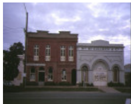
1 former permewan wright offices echuca front view