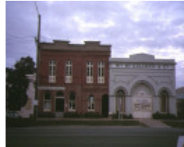
1 former permewan wright offices echuca front view