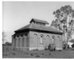
H1053 1 echuca pumping station 1964 slv