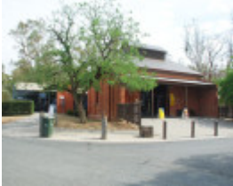
FORMER PUMPING STATION SOHE 2008