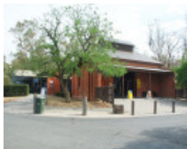
FORMER PUMPING STATION SOHE 2008