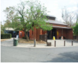
FORMER PUMPING STATION SOHE 2008