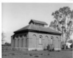
H1053 1 echuca pumping station 1964 slv