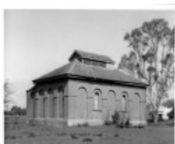
H1053 1 echuca pumping station 1964 slv