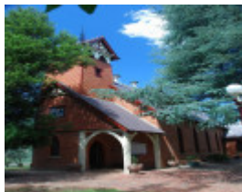
HOLY TRINITY CHURCH SOHE 2008