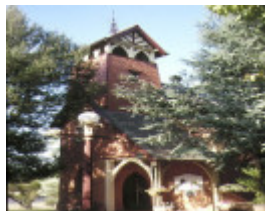
1 holy trinity church benalla front view mar1994