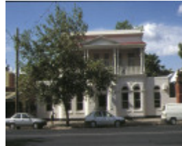
1 national bank benalla front view mar1994