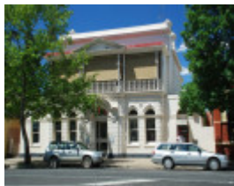
NATIONAL BANK SOHE 2008