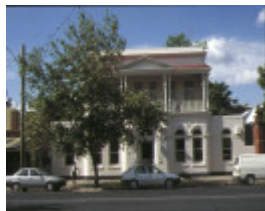
1 national bank benalla front view mar1994