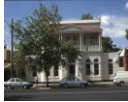
1 national bank benalla front view mar1994