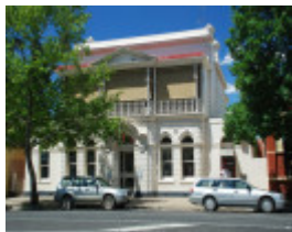
NATIONAL BANK SOHE 2008