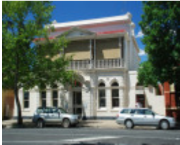
NATIONAL BANK SOHE 2008