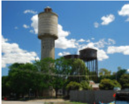
BENALLA WATER SUPPLY DEPOT SOHE 2008