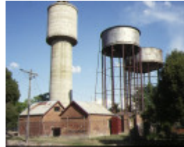
1 benalla water system benalla view of property