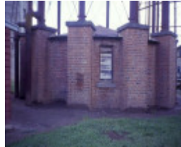
benalla water supply depot benalla blacksmiths shop she project 2003