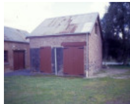
benalla water supply depot benalla pump shed she project 2003