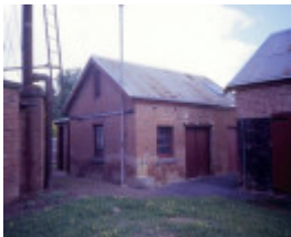
benalla water supply depot benalla carpenters shop she project 2003