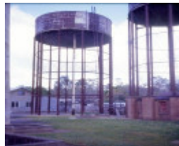
benalla water supply depot benalla steel tank she project 2003