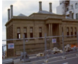
1 customs house geelong ac may00