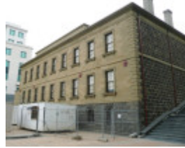
FORMER CUSTOMS HOUSE SOHE 2008