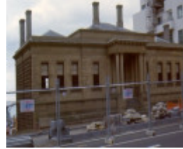
1 customs house geelong ac may00