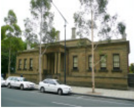
FORMER CUSTOMS HOUSE SOHE 2008