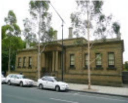
FORMER CUSTOMS HOUSE SOHE 2008