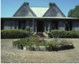
1 spray farm drysdale front view mar1989