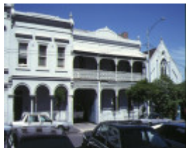
terrace 10 & 12 morrison place east melbourne street view nov1990