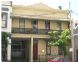
TERRACE SOHE 2008