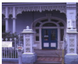
terrace 20 &amp; 22 morrison place east melbourne front entrance sep1981