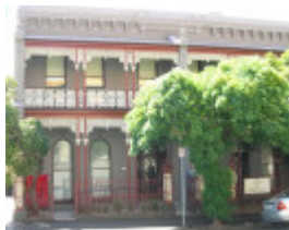
TERRACE SOHE 2008