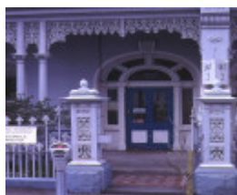
terrace 20 & 22 morrison place east melbourne front entrance sep1981