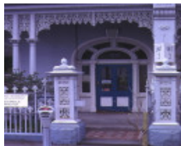
terrace 20 & 22 morrison place east melbourne front entrance sep1981