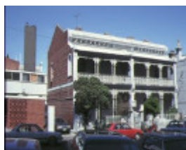
1 terrace 20 &amp; 22 morrison place east melbourne front view nov1990