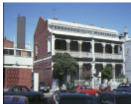
1 terrace 20 & 22 morrison place east melbourne front view nov1990